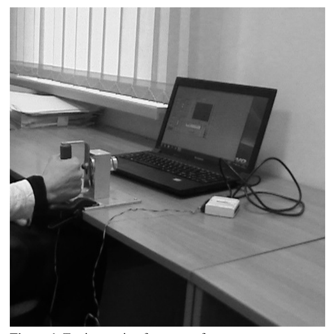
Figure 1. Testing station for range of movement assessment – goniometer

The participants did not have any opportunity to familiarize themselves with the appliance prior to testing. Each participant performed two tasks in each series. Blindfolded, they were asked to execute a pronation and supination movement with the dominant limb three times (standard movement), from the socalled neutral position (zero angle) and to the angle of 45 degrees. Upon reaching the 45 degree angle a loud buzzer was automatically activated. Immediately after that, the participants repeated the same movement five times, but this time from memory (blindfolded with no audio cue). Then, they performed same tasks with the non-dominant arm. The computer software recorded the maximum range of movement in each direction as the angle was attempted to be reproduced by the subject. The researchers controlled and adjusted