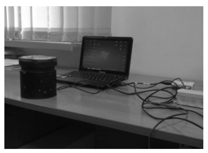
Figure 2. Testing station for assessment of reproduction of hand pressure force – dynamometer

The dynamometer used to evaluate the so-called force components of kinesthetic differentiation enabled the researchers to determine the precision of reproduction of hand pressure force (Figure 2).